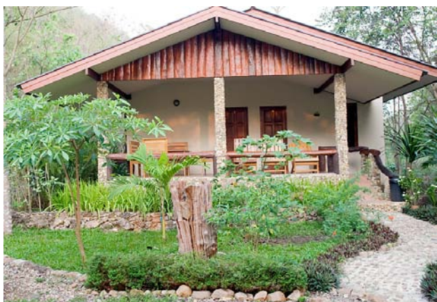
Chalet for 2 persons

We rented a bungalow for two (available with separate beds) for about 1000 baht/night, and enjoyed the spacious room with air-conditioning, tiled floors and en suite bathroom with hot water shower. Chalets are available that sleep up to 15 people and include four bathrooms. Drinking water is provided daily as well as towels and soap. The wooden furniture in each of the rooms is lovely, and there is ample storage space to unpack clothes and store equipment safely. There is no TV in the rooms and only one outlet to charge camera/flash batteries. There is no DSL internet service on-site (but dial-up internet is available on request). We found the cozy outdoor restaurant a great place to plug-in our laptops and process our digital photo files.