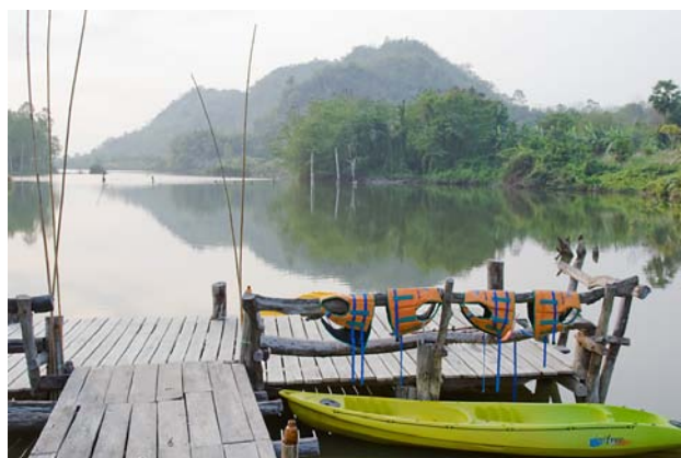
Lake at Baan Maka

We rented a bungalow for two (available with separate beds) for about 1000 baht/night, and enjoyed the spacious room with air-conditioning, tiled floors and en suite bathroom with hot water shower. Chalets are available that sleep up to 15 people and include four bathrooms. Drinking water is provided daily as well as towels and soap. The wooden furniture in each of the rooms is lovely, and there is ample storage space to unpack clothes and store equipment safely. There is no TV in the rooms and only one outlet to charge camera/flash batteries. There is no DSL internet service on-site (but dial-up internet is available on request). We found the cozy outdoor restaurant a great place to plug-in our laptops and process our digital photo files.