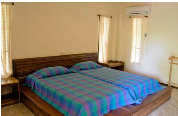
Chalet for 2 – interior