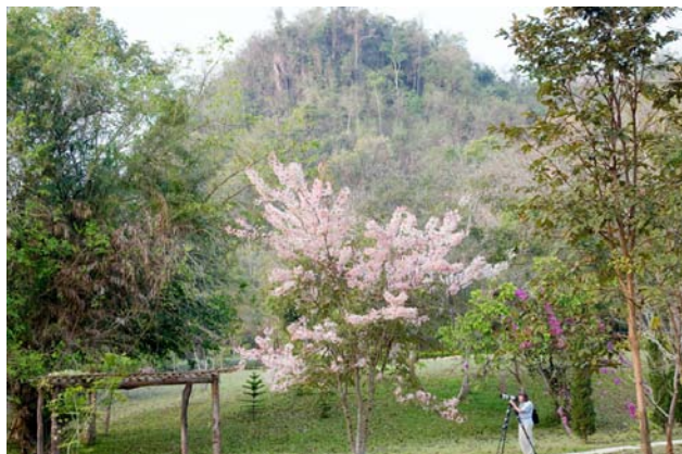
View of Baan Maka grounds

minutes drive from the park's entrance gate. More importantly, the lodge was set in scenic grounds and teemed with birds such as Spangled Drongos; Lesser Necklaced Laughingthrush; Green-billed Malkoha; Flavescent and Striped-throated Bulbuls; Verditer, Asian Paradise and Monarch Flycatchers; Striped Tit and Puff-throated Babblers; Blue Whistling Thrush; Asian Barred Owlet; Common and Black-capped Kingfishers, etc. And to our delight, the owners had set up two bird blinds (hides) complete with a water "drip" and fruit to attract an array of birds and small mammals to photograph. Since both of the operators of the resort (Gunn and Beverly) make digital images of birds, we quickly found that the hide is designed with birders, and especially bird photographers, in mind. For examples of splendid bird photography, see Gunn's photos on page 6 of this article.