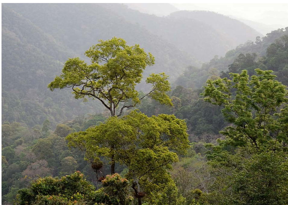
View of the broad-leaved evergreen forest from the second (900 meter) camp site at Kaeng Krachan