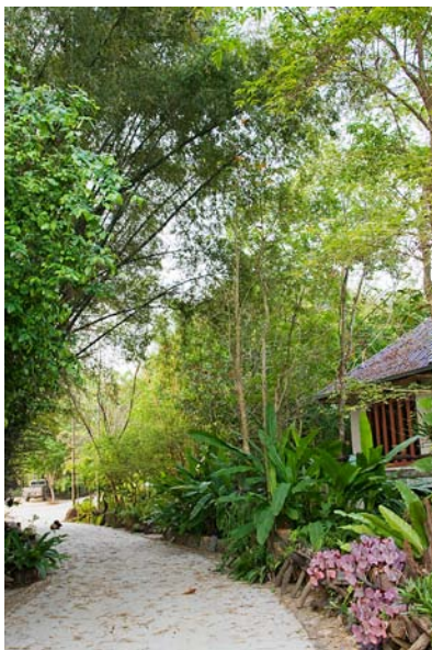
Entrance to the resort Baan Maka

One of the dilemmas for anyone interested in visiting Kaeng Krachan National Park is finding a place to stay within easy reach of the park. There are several options in the town of Kaeng Krachan that mostly cater to weekend visitors from Bangkok. However, travel to and from the town to the park takes at least an hour to the entrance gate, and an additional 45 minutes to the lower campground – if you have your own vehicle. You can hire a guide with a vehicle (about 1600-2000 baht/day), but this quickly becomes expensive if you wish to spend several days visiting the park.