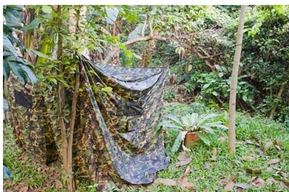
A bird blind (hide) at Baan Maka