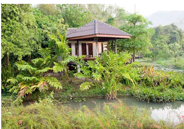
Chalet for 4-6 persons

Food is available at the on-site restaurant for about 30-100 baht per meal, and these are available to go. Fried Rice with pork will set you back about 40 baht while steamed fish (fillet with no bones) is about 80-120 baht. The Thai cook is friendly, and she is quite happy to adjust the spiciness of the food to your taste, and even make French Fries (chips). We recommend "pet nid-noy" – just a "little" spicy (= pet). Need your laundry done? About 100 baht will get a 5-10 kilo load washed, pressed and folded in one day. The staff here is friendly and more than willing to fulfill reasonable requests. Have a non-birder wife or significant other? This is also a great place for him/her.