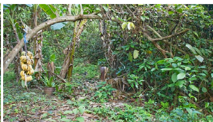
View from inside a bird blind

For independent travelers who do not have a 4-wheel drive vehicle, Baan Maka offers a superb opportunity to see Kaeng Krachan and to reach the high (900 meter) camp. By staying at the resort, it should be possible to catch a ride to the top, remain there for several days and then catch a ride back again. This you would need to arrange with Gunn and Beverly. For others interested in bird photography or a guide for the park itself, Gunn knows the park intimately well and when/where to look for the park's specialty birds including nesting Broadbills, Pittas, Woodpeckers, Bee-eaters and of course Racket-tailed Treepies – see Gunn's photos on the last page of this article.