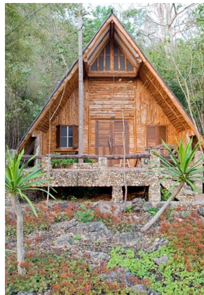
Chalet at Baan Maka