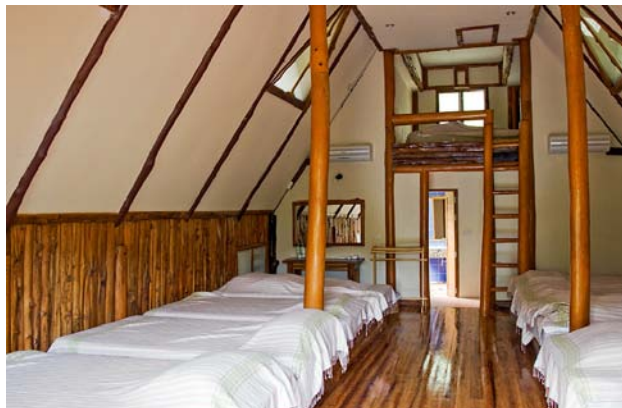
Chalet for 15 with four bathrooms